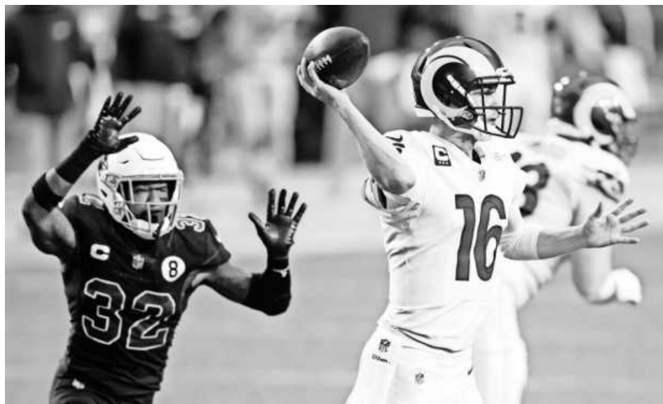
Rams quarterback Jared Goff had 351 passing yards and no turnovers against the Cardinals on Sunday.

The message was as clear as the transgressions were glaring.